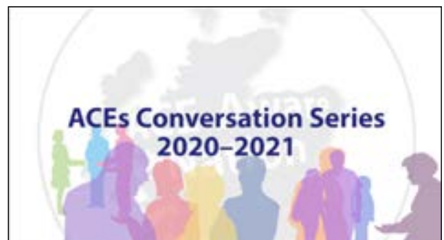
ACEs Conversation Series