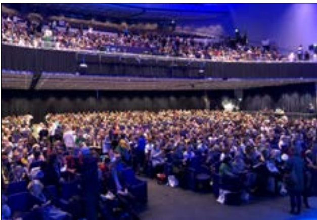
Making Scotland an ACE-Aware Nation Dr Nadine Burke Harris