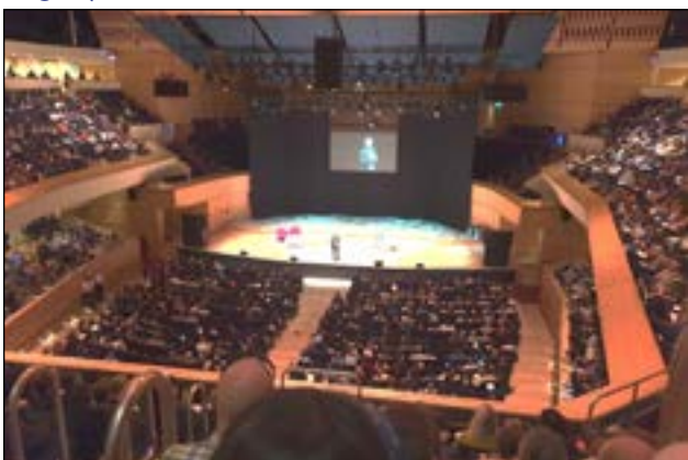
ACEs to Assets Dr Gabor Maté