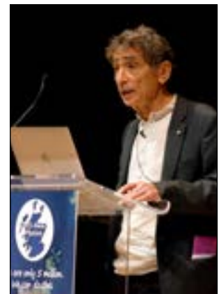
Immersive Event with Dr Gabor Maté